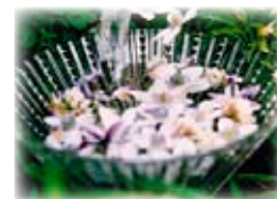
Collecting fresh flowers for potentising.